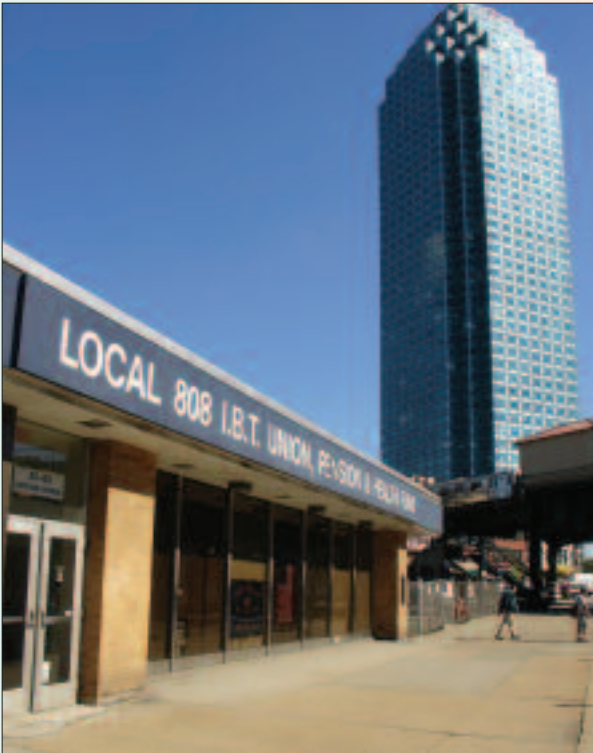
The Local 808 Health & Welfare Fund covers the health insurance needs of a thousand Teamster workers.

This newsletter is to announce a major change in the benefits provided by the Teamsters Local 808 Health & Welfare Fund. Effective May 1, 2008 the Plan will leave MagnaCare, and will move to a new and larger network of providers: Empire Blue Cross Blue Shield .